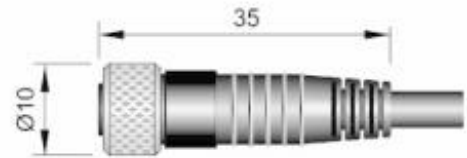
Configurazione e colori - vista lato frontale Configuration and wires color - front view